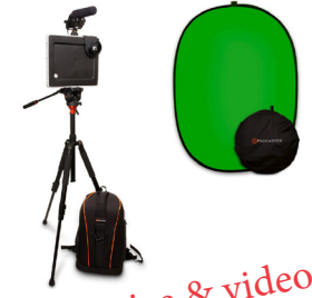
Voice & video equipment